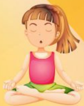
Fit India Movement: Indianising the Fitness Mantra