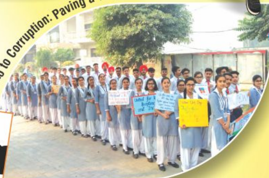
Constitution Day: Celebrating Republican Rights