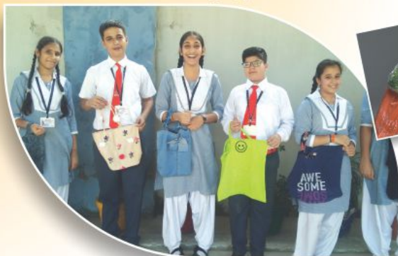
Reduce Plastic Waste: Go Organic