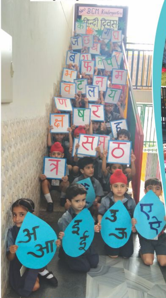
Strengthening the Roots