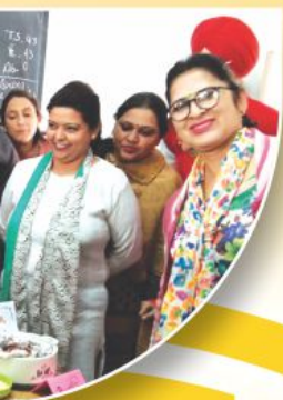
Nukkad Natak: Theatring Gandhian Era