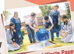
Recycling of Waste Paper

A Book fair was organised by the scholastic group in the school premises. The launch of year book 2020, a brand-new publication of scholastic made the event all the more exceptional. A wide array of books gave the children and staff members a splendid opportunity to explore the reader within. Avid readers were offered a new and fresh assortment of books on different genres, including various award winning titles and popular ones too.