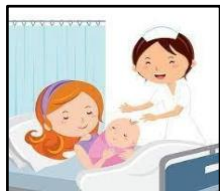
(a) Image 1