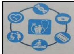
(b) Image (2)