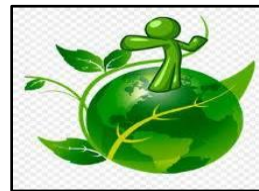
(d) Image (4)

(viii) 'Education and empowerment of women are closely related.' Explain.